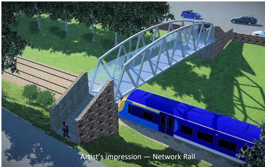
Artist's impression

The landowner on the far (east) side of the bridge has been approached and the Residents' Association is taking active steps to progress this project. However, with funding to be obtained, along with the necessary permissions plus construction, the project is likely to be measured in years. We will keep you posted.