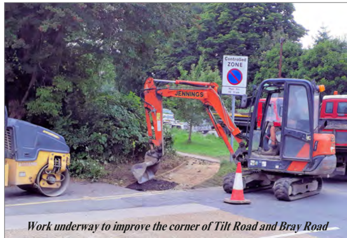
Work underway to improve the corner of Tilt Road and Bray Road